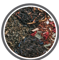
Multiple Forms of Material