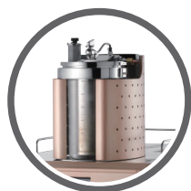
Electronic Lid Opening

The B6 SMART II can be set to brew 8 different materials in total. Dual boiler design and quick temperature control can satisfy all brewing needs. With three different brewing modes combining with the use of different materials, it allows for unlimited new drink development ideas. SD card memory storage makes it easy for chain stores to manage.