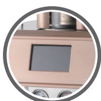
Smart Touch Screen Panel