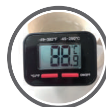
Quick Temperature Switch